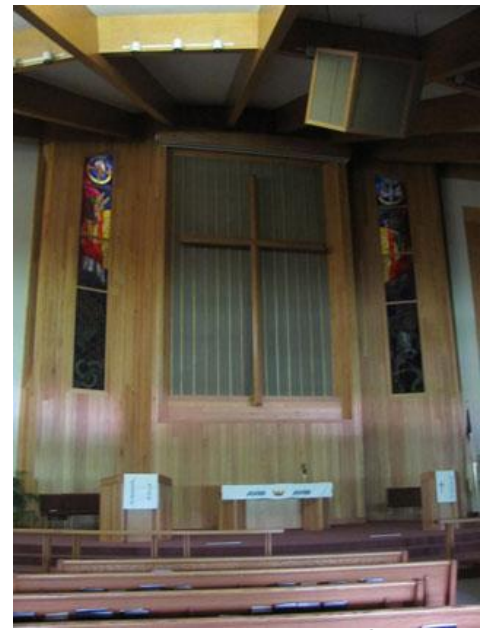
slev Foundation church is located on 4th Street near the S. Quad of campus. Services are open to all college students and they welcome students with a campus ministery.

Wesley UMC continues to host their annual Vacation Bible School June 20-24, from 6 p.m. to 8 p.m. Wesley also helps with Angel Food Ministry, an organization that provides food at low cost to anyone. The supply will be distributed this month from 10 a.m. to 12:30 p.m. Saturday at First Baptist Church