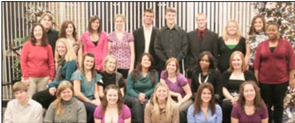
Society of Collegiate Journalists induction ceremony will be Dec. 7. The picture above is of the induction ceremony last year.

After the inductees are sworn in, on Dec. 7, SCJ will also