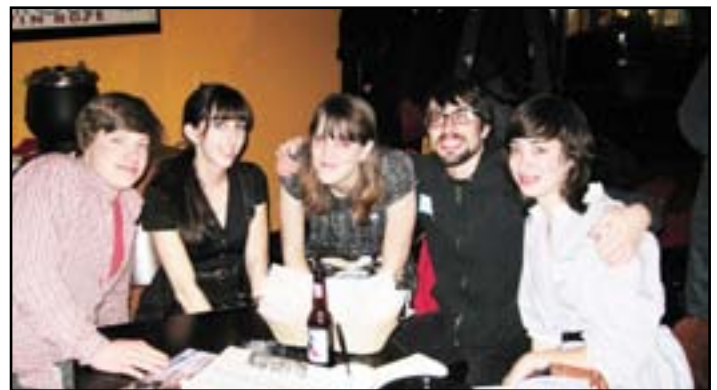
Students and alumni gather in Chicago every February to share what is going on in each other's lives.